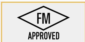
China's first certified by FM