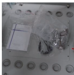
Cable entry holes