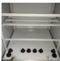
Battery bearing rack