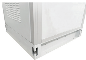
Bottom lifting holes